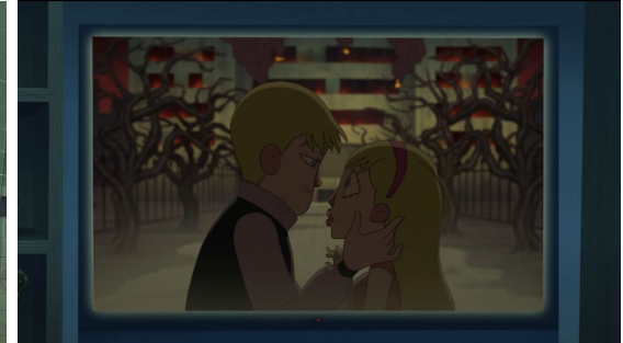
Al Bagshi, Y. (2019) For the Sake of Yousef . Available at: https://www.youtube.com/watch?v=5haFaTa6pc4 (Accessed 12 October 2022)