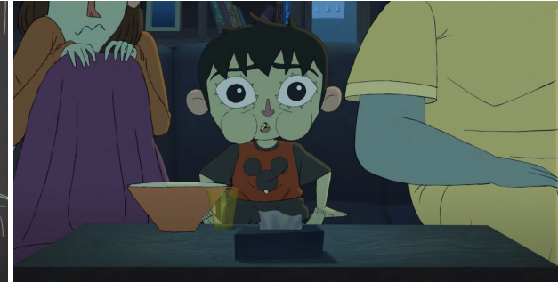
For the Sake of Yousef

Al Bagshi, Y. (2019) For the Sake of Yousef . Available at: https://www.youtube.com/watch?v=5haFaTa6pc4 (Accessed 14 October 2022)