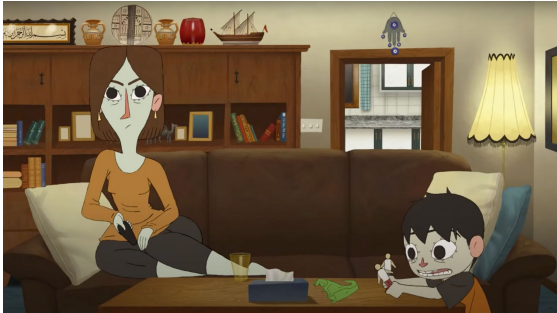
Al Bagshi, Y. (2019) For the Sake of Yousef . Available at: https://www.youtube.com/watch?v=5haFaTa6pc4 (Accessed 12 October 2022)