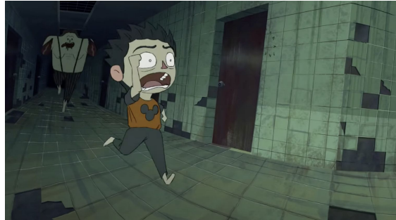
Al Bagshi, Y. (2019) For the Sake of Yousef . Available at: https://www.youtube.com/watch?v=5haFaTa6pc4 (Accessed 12 October 2022)